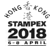
EXHIBIT ENTRY FORM

Fill in a separate form for each exhibit. Please print or type in block letters and send the completed form before 15 February to: